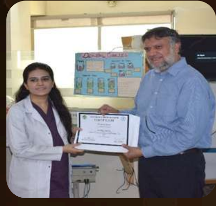
WORKSHOP ON CROWN AND BRIDGE