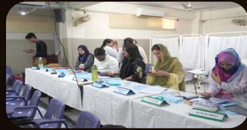
STEP-WISE APPROACH TO DENTAL IMPLANT