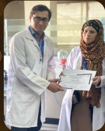
DEMISTIFYING ROTARY ENDODONTICS