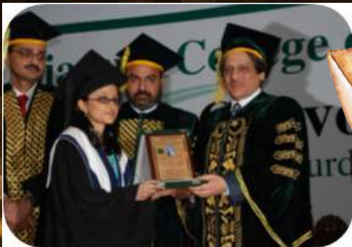
LCMD CONVOCATION 2008