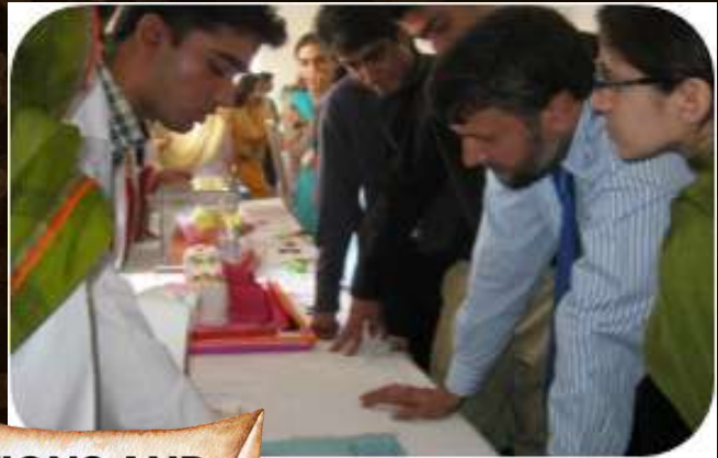
COMPETITIONS AND ACHIEVEMENTS