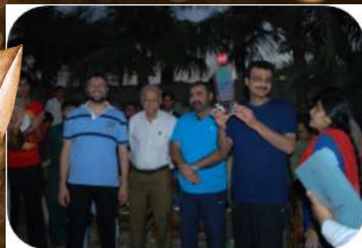
LCMD CRICKET TOURNAMENT